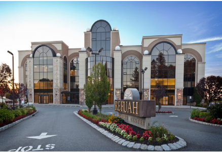
Refuah Health Center

Continuing to expand opportunities for students to develop their clinical skills, NYMC has formed academic affiliations with Westmed Medical Group in Westchester and with Refuah Health Center in Rockland County, New York, designating both as teaching sites for the training and education of undergraduate medical students.