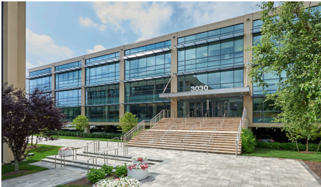
Westmed Medical Group

The affiliation with Westmed establishes elective rotations in pediatrics, neurology, rheumatology, gastroenterology, cardiology, radiology and obstetrics and gynecology. Westmed is a multispecialty practice, offering more than 60 medical specialties and sub-specialties across 13 locations in Westchester County, New York, and Fairfield County, Connecticut.