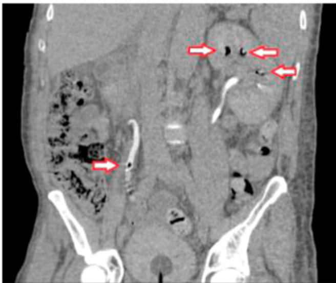
Fig. 2. Follow up CT abdomen showing air in the left collecting system and right ureter.

caused by C. tropicalis [3]. Emphysematous infections should be higher on the differential for diabetic patients. The method of choice for diagnosis and follow up of emphysematous UTI is CT