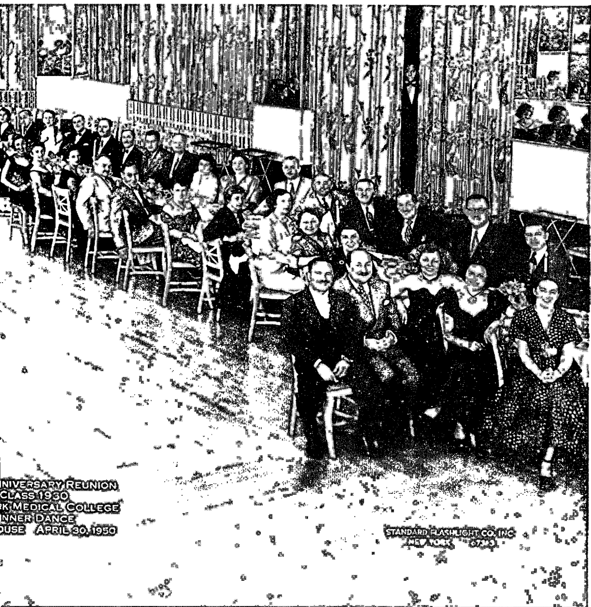
ANNIVERSARY REUNION CLASS 1930 BROOKLYN MEDICAL COLLEGE INNER DANCE HOUSE APRIL 30, 1950

STANDARD FLASHLIGHT CO. INC. NEW YORK 67243