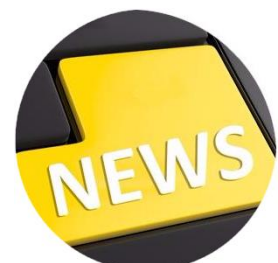
As leaders in a variety of specialties and fields, New York Medical College's faculty have