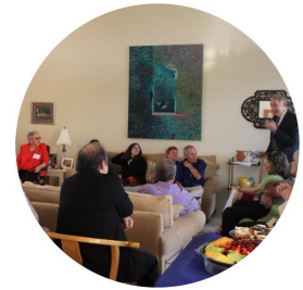
View photos from Alumni Event, Boca Raton, Fla., February 2017.