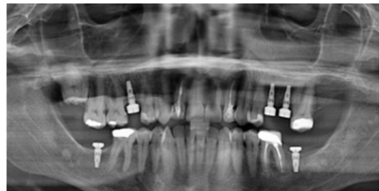
Figure 3. Post-operative panoramic radiograph.

borne guides were seated, and implant osteotomies were created through the guides. The implants were placed with very good primary stability. Healing abutments were placed, and the flaps were sutured around them to allow for an easier transition to the final crown. As can be seen from the radiograph (Figure 3), align-