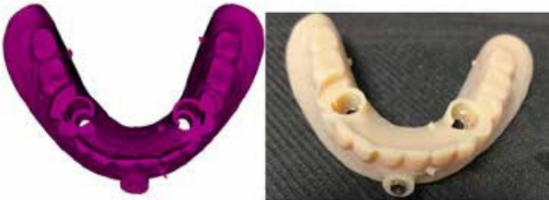
Figure 6. Tissue borne surgical guide based on denture.

an implant-supported overdenture. Radiographic markers were placed on his denture, and they were scanned in a cone beam machine, thus creating a DICOM format that can be converted within the GPS BlueSky Plan software to an STL format (Figure 5). Once we aligned the STL to the edentulous DICOM data, we were then able to plan our implants. Still utilizing this same virtual denture duplicate, a mucosa based surgical guide was created (Figure 6) following the contour of his current denture. The implant osteot-