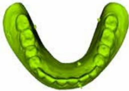
Figure 5. Virtual denture duplicate with radio-graphic markers present.