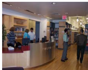
The New Midtown Library— See page 5.

The Midtown Library has relocated from 33 to 43 West