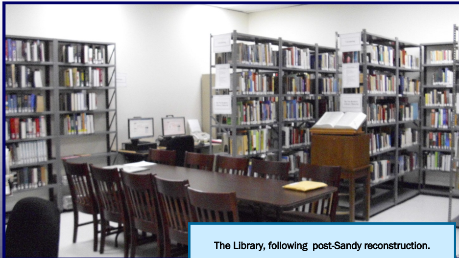
The Library, following post-Sandy reconstruction.

Sandy did a lot of damage, but as of April 2013, everything has been completely restored and the library is back to its fully operational status. After reopening to Touro students and faculty in February, the library is now up and running normally again.