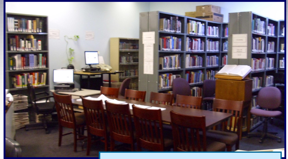
The Brighton Beach Campus Library in drier times.

Touro's Brighton Beach campus is located in southern Brooklyn, near the Atlantic Ocean and the Coney Island boardwalk. Hurricane Sandy devastated the neighborhood in October 2012, flooding homes and businesses for many blocks, including the building which houses the Brighton Beach campus library. The floodwaters inside the library were knee deep, destroying furniture, equipment, and all the books on the library's lower shelves. Nothing touched by the water was salvageable; all impacted materials had to be discarded. Once the waters receded, the clean-up and reconstruction began. The surviving books and equipment were packed away. Construction crews came in and took down the walls and removed the carpeting. Electricians replaced the wiring and electrical outlets throughout the facility. The room was painted and new linoleum was installed to replace the ruined carpets. After renovations were completed, all the rescued books were re-shelved.