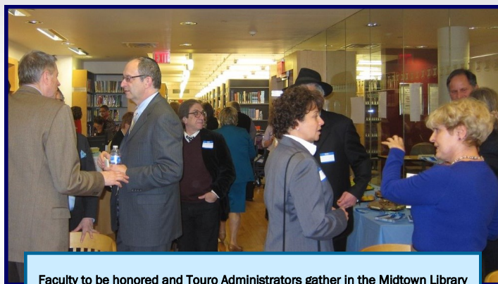
Faculty to be honored and Touro Administrators gather in the Midtown Library