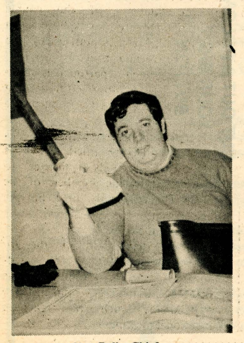
New Ballet Chief

The voice, as well as our guest, then enters the Fourth Floor, where our administrative offices are found. From this floor all important decisions originate and, if necessary, are reversed. Although this may be an architectual anomaly, the very foundations of our institution lay on the Fourth floor. It is perhaps for this reason that Touro has never swayed.