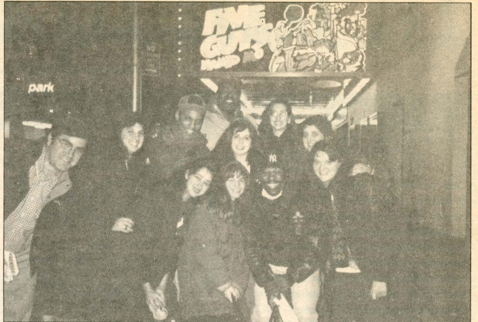
Touro students with cast members of "Five Guys Named Moe".