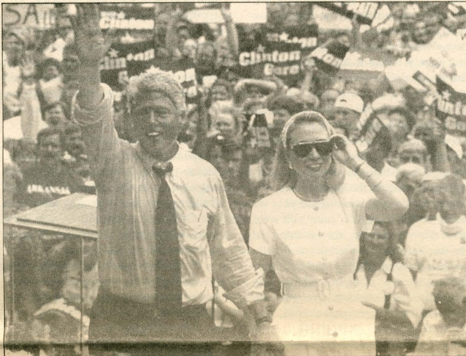
President and Hillary Clinton

Maybe Americans would be happier with a set fashioned after the first-ever Presidential Elections in Syria. In 1991, in an attempt to appear Democratic, the Syrian government held an election in which almost seven million