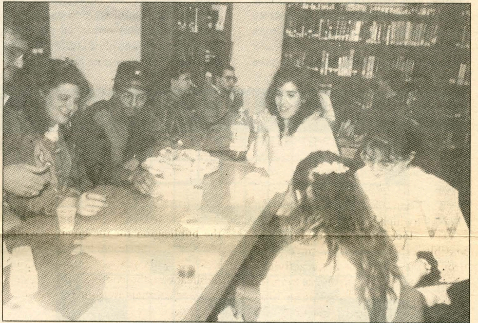
Dreidal Tournament at the Chanukah chagiga.